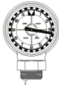
Floating Suction Face Plate