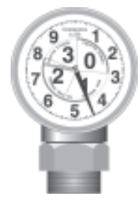
Metric Face Plate