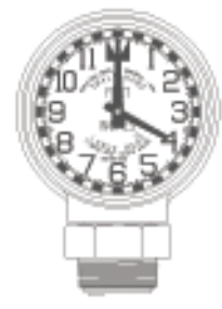
Standard Face Plate